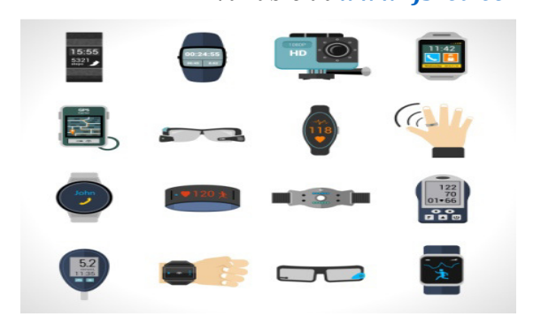
Fig 1. Applications of Wearable Electronics