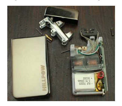
Fig 4. Ignition switch