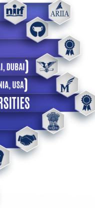
Governor Award (Fourth time)