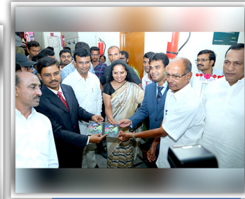
Appreciation from Smt. Kalvakuntla Kavitha Garu, Sri Ch. Malla Reddy Garu, Sri K.P. Vivekananda Garu,