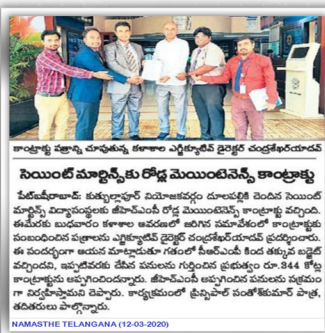
NAMASTE TELANGANA (12-03-2020)