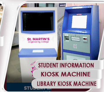
STUDENT INFORMATION KIOSK MACHINE LIBRARY KIOSK MACHINE