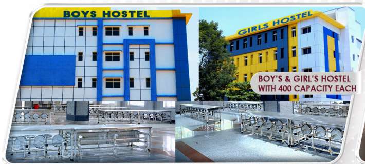
BOY'S & GIRL'S HOSTEL WITH 400 CAPACITY EACH

The College has a spacious Library with 9700 titles and more than 90000 Volumes of books consisting Indian and International editions on various topics accompanied by important Journals, Magazines, News Papers to keep students abreast of the latest advancements and developments in the field of Science, Engineering, Technology & Management. A well equipped Digital Library with over 9100 plus video lessons from NPTEL data sharing available in the college. A well spaced out reading room and reference section with extensive reading material on GATE, GRE, TOEFL, GMAT, CAT and UPSC based texts are also available. The library has membership with British library, Delnet, IEEE, ASME, ASCE and J-GATE.