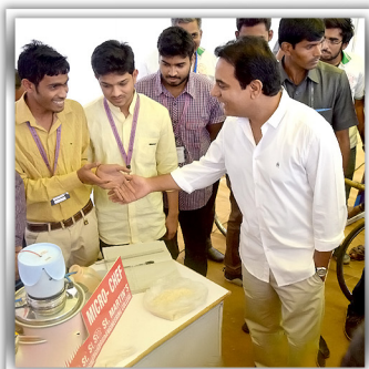
KTR, IT MINISTER OF TELANGANA CONGRATULATING ST. MARTIN'S ENGINEERING COLLEGE STUDENTS.

SRI VENKAIAH NAIDU, VICE PRESIDENT OF INDIA CONGRATULATED FOR WINNING FIRST, SECOND AND THIRD PRIZE AT NIRDPR