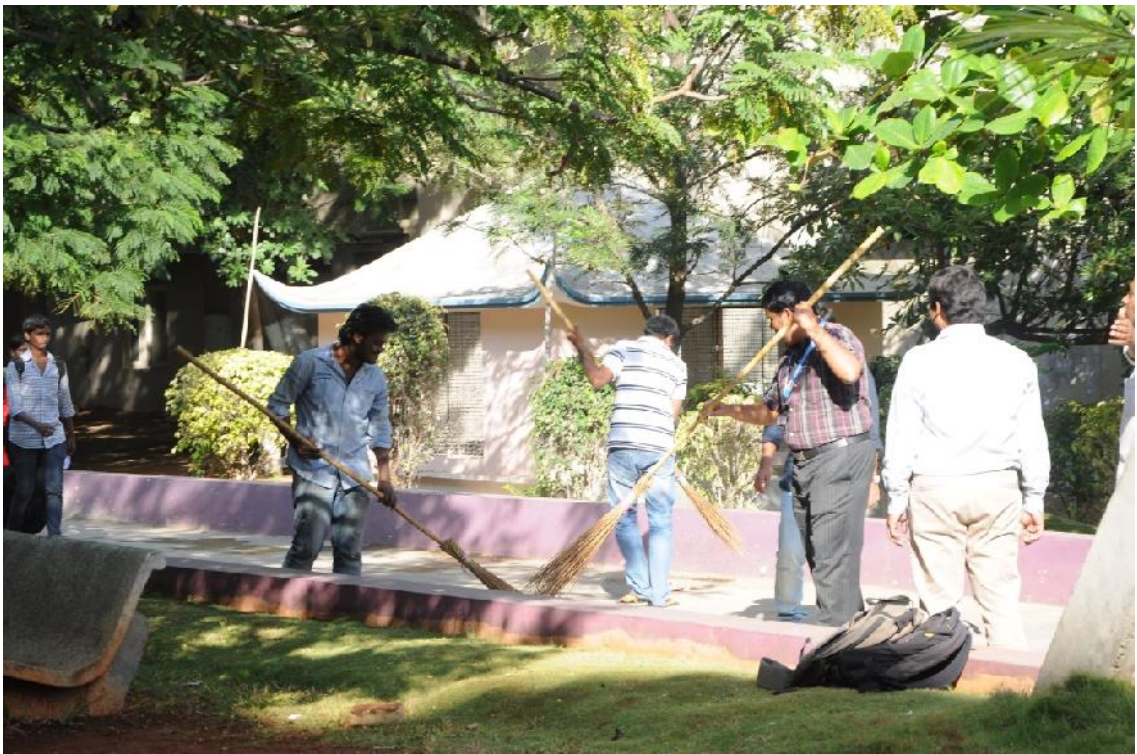
Pic: Active participation of College employees and students in Swachh Bharath