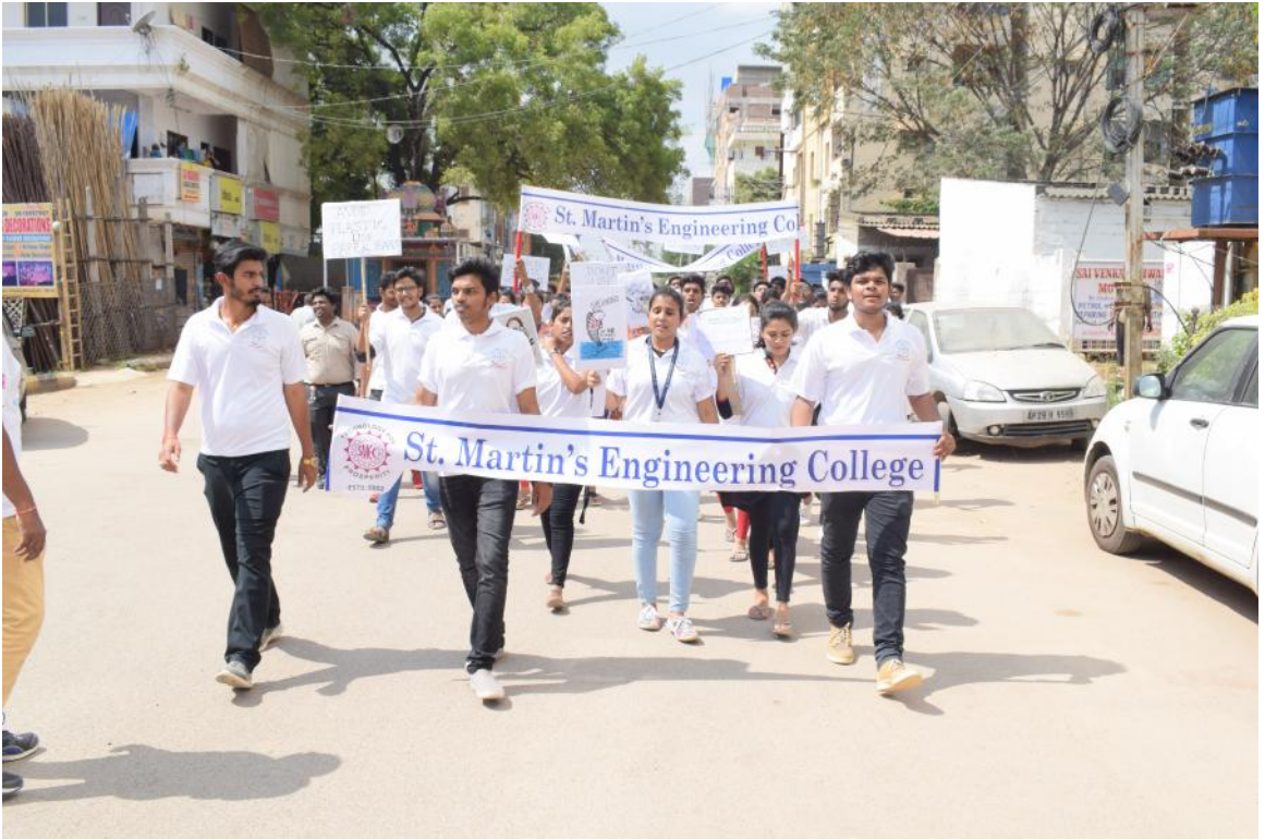
Pic: Say No To Plastic campaigning on in Kompally village