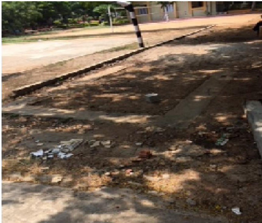
Pic: Rain water harvesting plants in College Playground