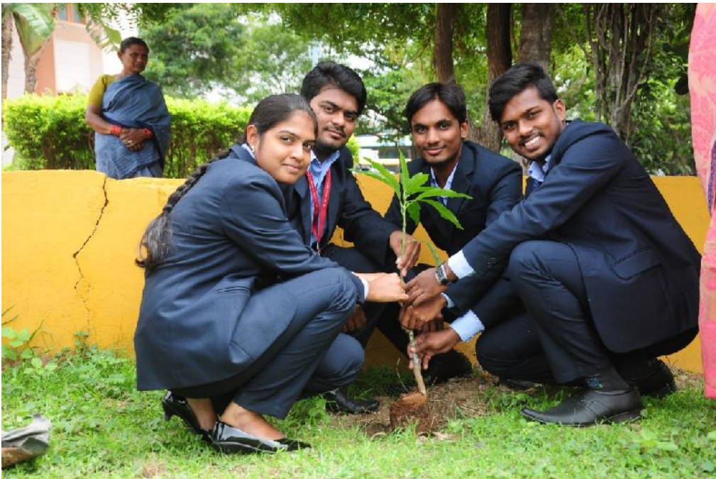
Pic: An Initiative from students in haritha Haram programme