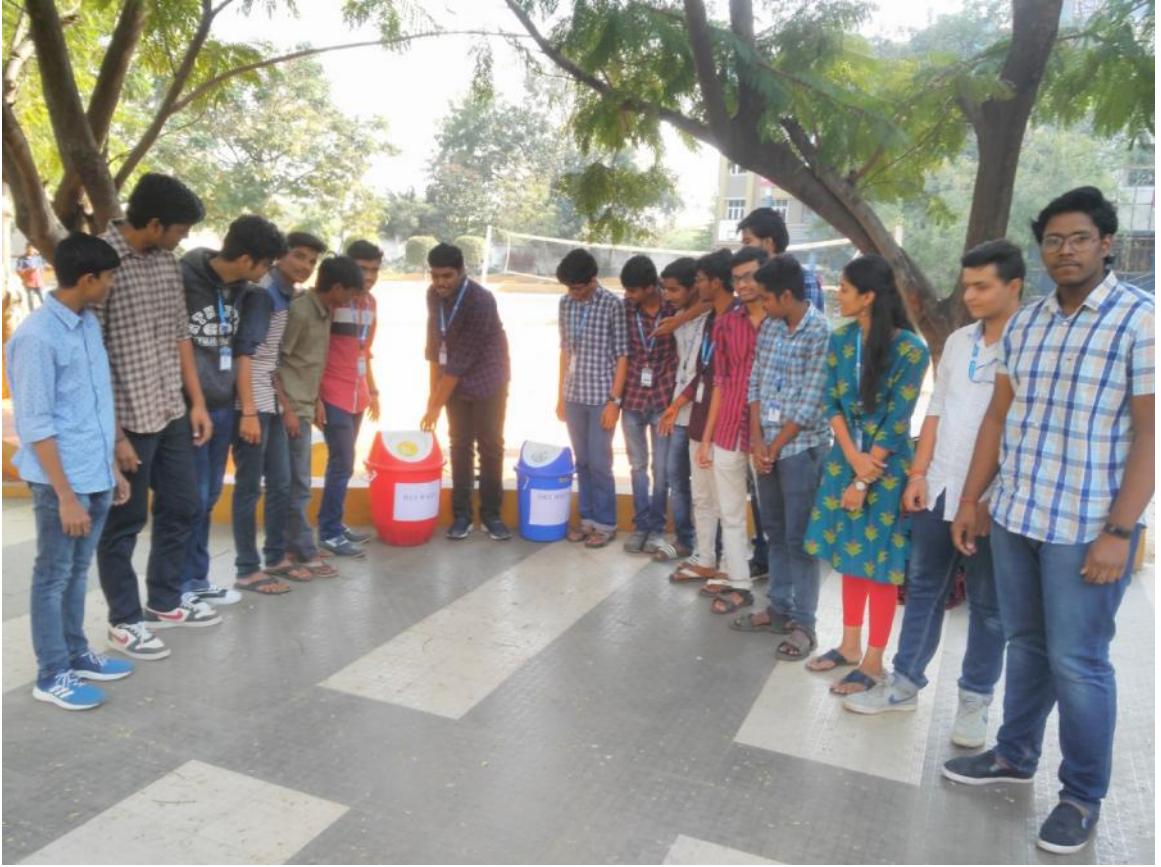
Pic: An initiative from students on segregation of waste