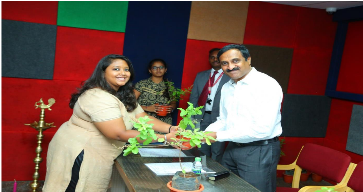
Figure 2.Presenting a plant to Chief Guest 8th June 2019