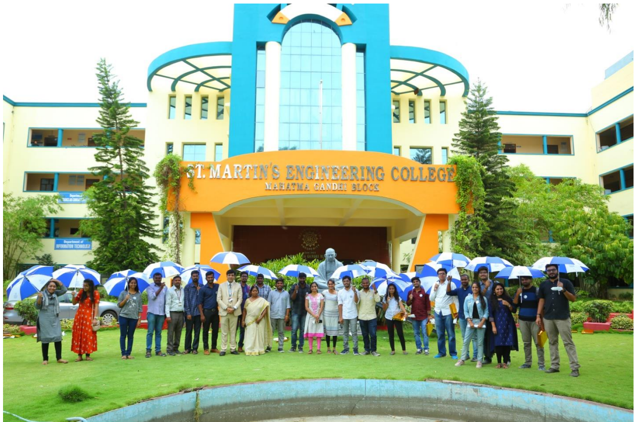
Figure 10. Disha Alumni MEET 8th June 2019