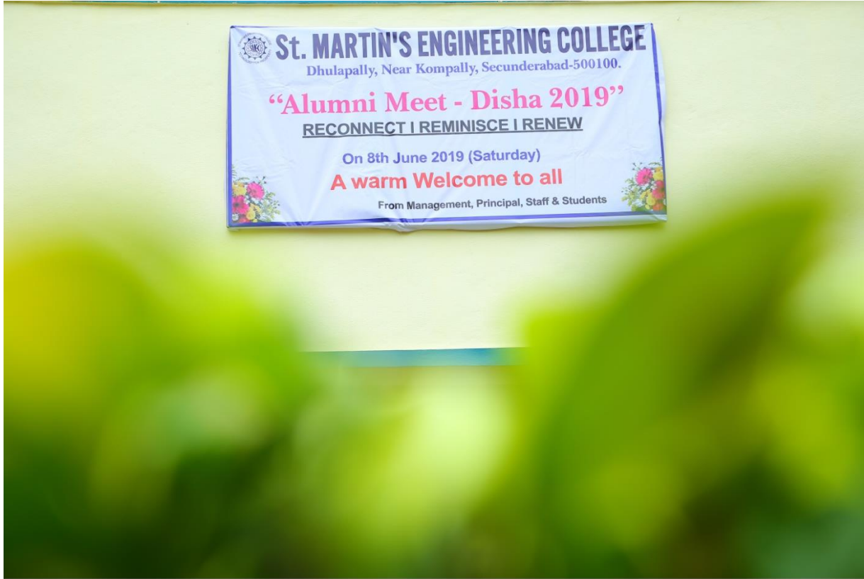
Figure 1.Disha Alumni Meet 8th June 2019