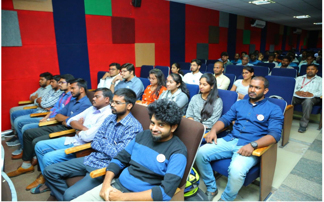
Figure 5. Alumni students 8th June 2019