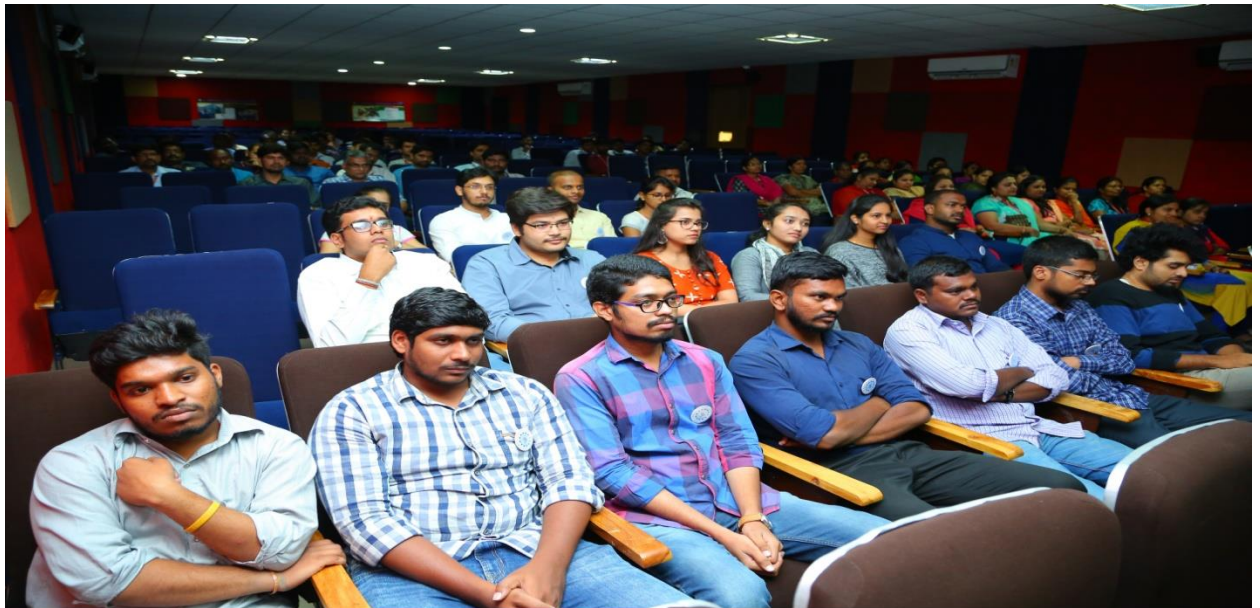
Figure 6. Alumni students 8th June 2019