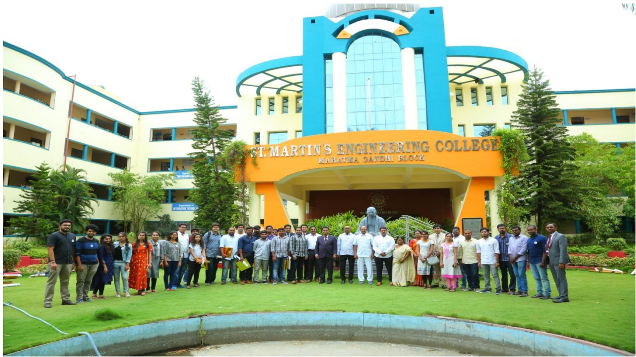
Figure 9. Disha Alumni MEET Alumni Group Photo 8th June 2019