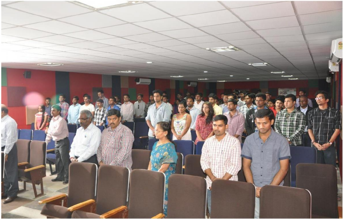
Alumni meet on 06-12-2014